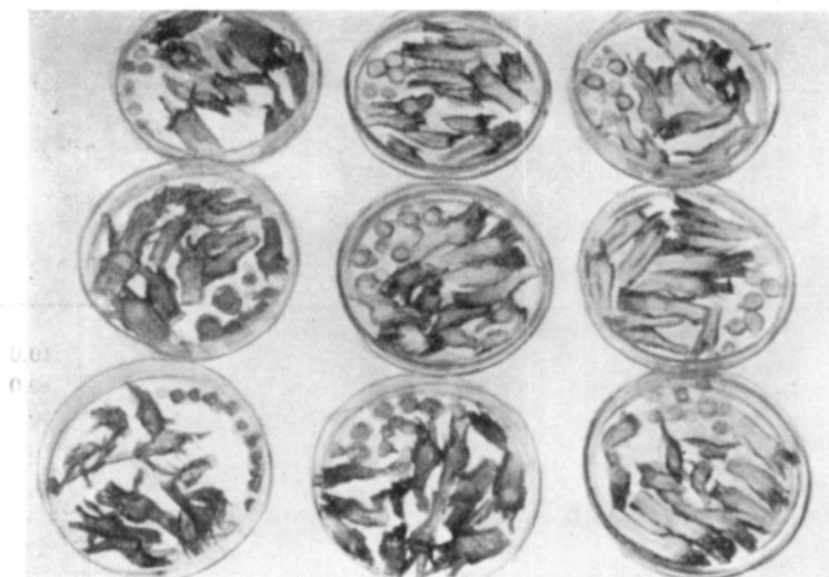
Fig. 3. Vertical sections of the base and transverse sections of the tap root (3 cm below the base) of winter turnip rape. Results of the tetrazolium test after treatments at -15^{\circ}\text{C} .