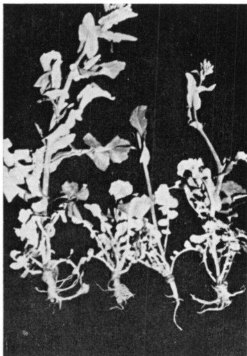
Fig. 2. Winter turnip rape plants, the tap root of which has been frozen during the winter.

During the winter of 1955—1956 in another field not contaminated by club root fungus, the winter turnip rape overwintered best in areas where there was abundant snow (Table 2). In areas with almost no snow the stand had thinned out considerably. Because no low temperature fungus infection of the plants or accumulation of surface water was observed, it seemed probable that the damage