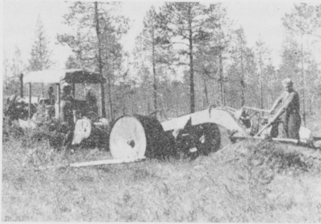
Fig. 3. Forest ditch plow constructed by the Pellonraivaus Oy.

heavily overgrown with trees, where ditching by manual labour has previously involved great difficulties. The amount of work accomplished varies considerably, depending on the local conditions; but the average result for an 8-hour day has been 800—1 000 running meters. Tractors in the Caterpillar D 6 and Allis-Chalmers HD 9 class fitted with a winch are used as draught machines. In wet peatlands lacking a firm surface it is necessary to increase the carrying capacity of the tractor tracks by adding wide wooden shoes bolted on tracks — a measure that, however, raises the ditching costs to some degree. The machine labour operating costs have been 30—35 Fmks./rm. Since, in addition, it has been necessary to resort to manual labour in digging the ends of the drains, and, particularly, in cleaning out the ditches in wooded areas, extra costs are involved, amounting on an average to about 10 Fmks./rm.