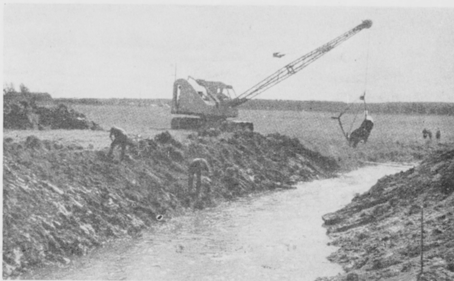
Fig. 1. A Link-Belt dragline equipped with a 0.4 m 3 bucket engaged in clearing out a discharge drain.

According to recently made conservative estimates, Finland has approximately 1 614 000 ha. of land capable of being reclaimed. Of this total the northern part of the country, consisting of the provinces of Oulu and Lapland, accounts for 1 276 100 ha. and the southern part for 337 400 ha. (3). The main part of the reclaimable area consists of swampland (i.e. wet peatland), which forms about 65 % of the above figure for southern Finland and about 90 % for northern Finland. The average share of swampland in relation to the total reclaimable area is approximately 85 %. The main emphasis in the reclamation program will therefore continue to be placed on the reclaiming of swamps.