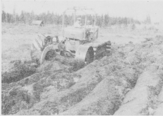
Fig. 6. Land clearing in a bog with a thick layer of peat. Allis-Chalmers HD 5 track-type tractor equipped with wooden shoes bolted on tracks. A large Fiskars-model land clearing plow used for ploughing.

As five-ton caterpillar-type tractors and heavy-duty specially constructed land clearing ploughs are generally used as draught machines, stumps less than 15 cm. in thickness ordinarily constitute no obstruction to ploughing (Fig. 6). This kind of pioneer ploughing of wet peatland, which has been preceded by no removal of stumps, is accordingly termed land clearance ploughing.