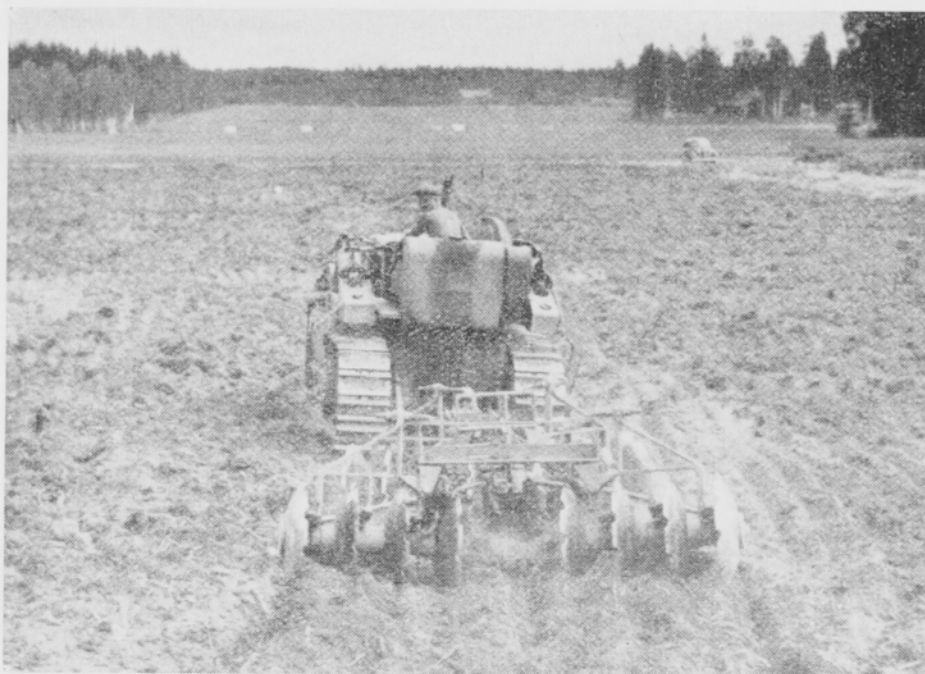
Fig. 7. Reclamation harrowing with a Rome Plow harrow. International TD 14 track-type tractor used as draught machine.

Usually, reclamation harrowing is therefore carried out with heavy disc harrows, the diameter of the discs being about 60 cm. Five-ton caterpillar-type tractors provide the draught power. The harrowing is mostly done at least twice. If the bog is «sinewy» or if there is peat in the surface layer that has not become muddy, it is generally advantageous to use disc harrows with toothed edges on the discs (Fig. 7). These harrows, which are heavier than ordinary disc harrows, generally require caterpillar-type tractors in the 9-ton class to supply the draught power. In some cases reclamation ploughing can be entirely replaced by the soil preparation accomplished by such harrowing, though, this can be done only under extremely favourable conditions and when the peat has throughout almost turned into mud.