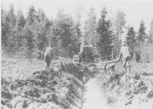
Fig. 4. Land clearing ditching in mineral soil with a Liitso-model plow. Allis-Chalmers HD 5 -model track-type tractor used as draught machine.

In areas of mineral soil and shallow layers of peat turning into swamp, as well as in swamps with thick layers of peat but few snags and stumps, it is possible in the digging of open ditches to use also strongly built open ditch plows designed for reclamation work in ordinary mineral soil, such as e.g. the Liitso-model ploughs