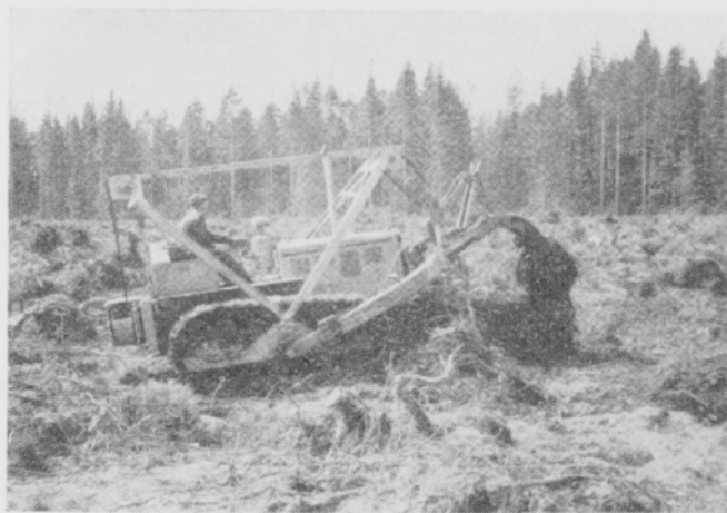
Fig. 5. Caterpillar D 4 tractor equipped with a stumpfork for removing stumps.

Tearing stumps loose is carried out in mineral soil with machines of the Caterpillar D 6 and D 7 class, equipped with a rake blade bulldozer, and these machines represent the standard model for such work. In swamplands with a weak carrying capacity, however, the use of such machines leads to difficulties because they often