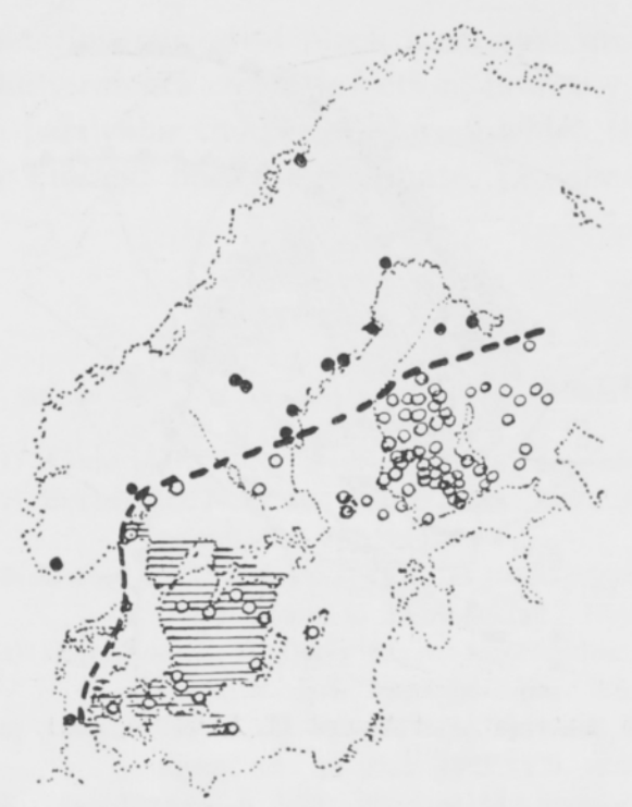
Fig. 1. Limit of the epidemic area of black stem rust in Northern Europe in summer 1951. The lines = the centre of the epidemic, white dots = rust has occurred, and black dots = no epidemic (according to (5) and own information).