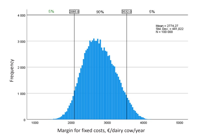
Fig. 2. Distribution of margin for fixed costs in herds with 120 dairy cows, automatic milking system, and blanket dry cow therapy (probability of post-calving intramammary infection 0.18).