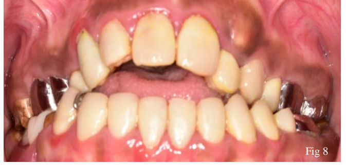
was done. After shade selection putty impression was taken and sent to lab for indirect composite veneers. Veneers were cemented with Relyx cement as shown in Fig 8.

Metal crowns after root canal treatments were given. Veneer preparation was done with tapering fissure bur. First the existing composite restorations were removed then 0.75mm cutting