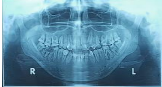
Figure 1: Orthopantomogram

Radiographic findings: Figure no.1 is showing Orthopantomogram (OPG) on which it was found that tooth #46 #47 (Federation Dentire International Classification of teeth) were grossly carious and were not in a condition to be saved anymore as their furcation were involved with minimal coronal tooth structure left ,as shown in Fig 2. Hence, she was