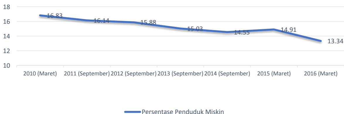
Figure 2 Percentage of people living in poverty in the Province of D.I. Yogyakarta in 2010-2016

caused by adjustments to the policy of subsidized fuel in Indonesia between September 2014 and March 2015. This caused the inflation rate in Indonesia to accumulate to 7.26 percent (BI, 2014).