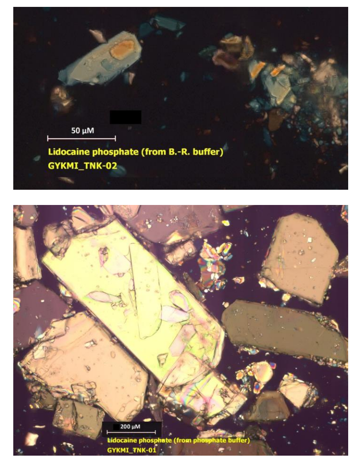
Figure 2 . Microphotographs of lidocaine phosphate solids obtained from solubility experiments: (a) Britton-Robinson buffer, (b) Sörensen buffer.