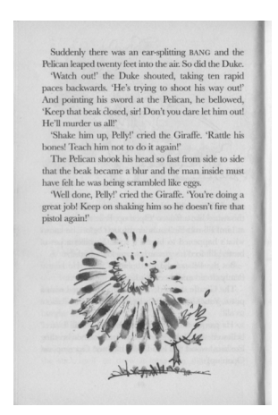
This illustration provides imagination of the sound of the Pelican bird shaking the thief

Dahl used word picture to describe the illustration of a screaming lady.