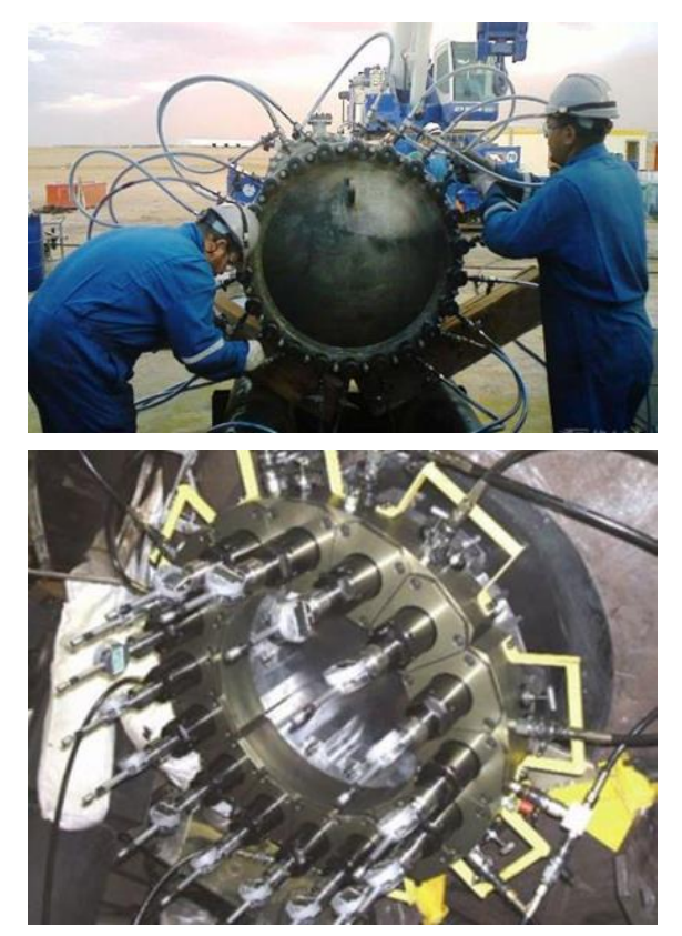
Figure 1: Application of stretcher in wind power and nuclear power industry

the hydraulic stretcher plays an irreplaceable role, as Figure 1.