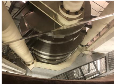
Figure 1: The 1 MN deadweight force standard machine

The 1 MN DFSM adopts a binary sequence of ten weights (two 10 kN weights, three weights of 20 kN, 40 kN, and 80 kN, four weights of 160 kN, and one weight of 200 kN), consisting of stainless steel discs. Each of them can be applied to the loading frame independently to the others. In this way, it is possible to generate a large number of force values from 10 kN up to a maximum capacity of 1 MN with steps of 10 kN, and to perform a self-calibration of the weights to check the stability of the standard without dismantling the whole system [4]. The selection of the weights is performed by an electro-pneumatic system, software controlled, and supported by an electric motor able to generate a constant load on the force transducer during weights replacement operations. The load is kept constant by a feedback system exploiting the deformation elasticity of the loading frame.