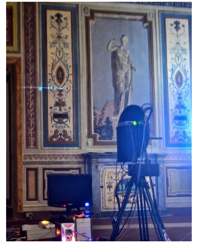
Figure 2. LIF system operating at the Bishop's Palace of Frascati. Laser beam line visible on the left wall.

The results of the proposed integrated approach can be of great usefulness for site conservation. The ability to detect and localise early signs of damage before they are clearly visible using non-invasive and rapid techniques can ensure that interventions and restoration actions are performed in time. Moreover, the periodic repetition of this kind of investigation involving the combined results of different applied techniques regarding possible changes in the areas of interest, such as changes in the dimensions of bio-deteriorated areas or chemical degradation of the restoration materials, could be used to monitor degradation processes.