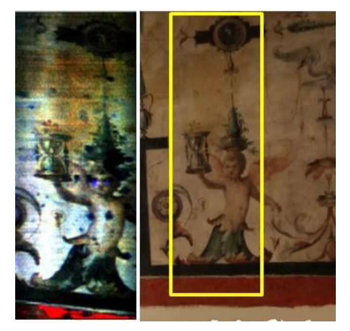
Figure 5. False colour LIF image reconstructed at 300, 400 and 500 nm on the left; photogrammetric image with measured area in the yellow line on the right.

resolution. The ITR scanner is based on a polar coordinate system, so its spatial resolution is dependent on the distance between the instrument and the target. In the presented case study, the acquisition was made at an average distance of 5 m, and the angular point-to-point resolution of the motorised mirror was set at 2–4 mdeg. The average point-to-point spatial resolution was about 0.3–0.5 mm. A complete dissertation presenting a comparison of the image resolutions of standard commercial scanner cameras and RGB-ITR as well as comparisons of their data resolution and accuracy can be found in a published paper [23]. During the acquisition phase, a linear calibration procedure was completed that consisted of pointing