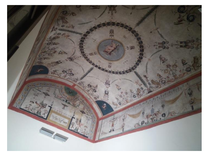
Figure 1. Stufetta vault at the Bishop's Palace of Frascati.

[9], [9]. In this study, this technology was used in synergy with other non-invasive techniques that can localise bio-deteriorated areas and added restoration materials in order to support and integrate the experimental results. In particular, the structure from motion (SfM) method [10] was used to obtain a 3D photogrammetric reconstruction of the painted vault of the Stufetta Room in a very short time with accurate structure in terms of geometry and texture. This technique is commonly applied in the study of cultural heritage assets [11]. Along with these instruments, a red-green-blue imaging topological radar (RGB-ITR) 3D laser scanner prototype was used to digitalise the Landscape Room. This 3D laser scanner has already been employed for remote diagnostics of cultural heritage [12], [14]. Its ability to measure in situ remotely along with its complete non-invasiveness eliminate the use of scaffolds, reducing the time and cost of the analysis. The obtained results highlighted the localised presence of different materials resulting from retouching or consolidating processes, even in areas where differences are not appreciable by the naked eye. Deterioration phenomena, mainly due to environmental humidity, were also localised by the system in places where they were not clearly evident, suggesting the possibility of early detection of damage. The available techniques for characterising and monitoring biodegradation [15], [15] can be supported by the presented approach.