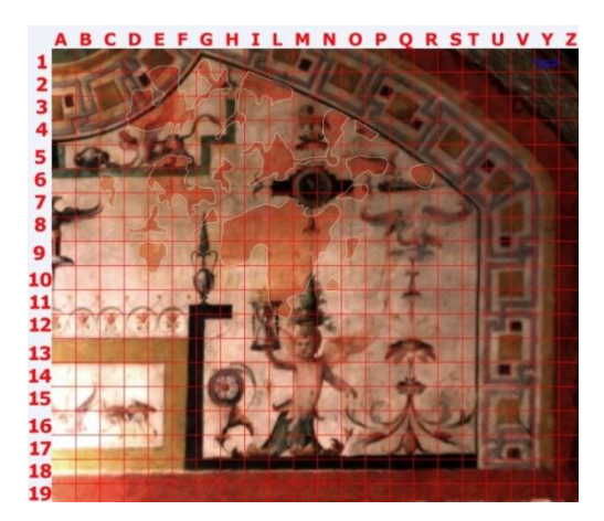
Figure 7. Photogrammetric details of the lunette at 1:1 scale.

the laser beam at a calibrated white target from several distances; the resulting curves were used during the post-process phase to normalise the colour channel values. The Landscape Room, which is about 10 \times 10 \times 3 m<sup>3</sup>, was digitalised in 4 days without needing to wait for optimal ambient light; the sun provided light during the day and artificial lights were used during the night.