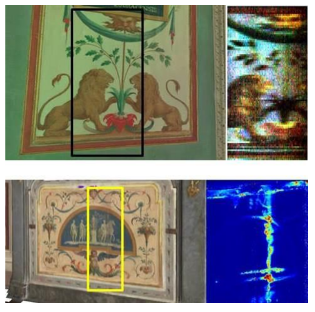
Figure 9. Top: RGB-ITR image with measured area in black line (left) and corresponding false colour LIF image (right).

Bottom: Fire screen RGB-ITR image, with measured area in yellow line (left) and corresponding LIF 380/450 nm image (right).