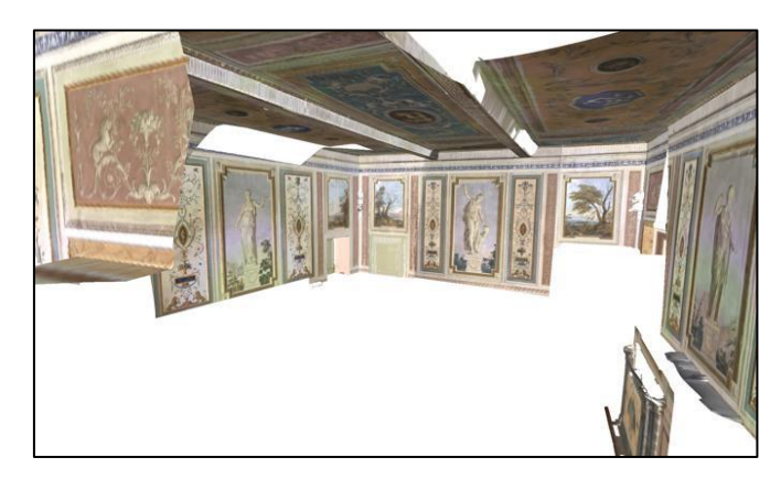
Figure 8. Partial 3D model reconstruction of the Landscape Room obtained by RGB-ITR scanner.

The 3D scale model of the Stufetta tunnel vault obtained by photogrammetry makes it possible to focus on particular details in order to support and integrate the measurements and experimental results of other non-destructive testing techniques [24]. After the photogrammetric measurements were completed, the LIF scanning system was applied to the investigation of the Stufetta vault. In Figure 5, the false colour LIF image, reconstructed at 300, 400 and 500 nm, is reported on the left. The relative photogrammetric image, with the measured area outlined by the yellow line, is reported as a reference on the right. As can be observed, some details not appreciable by the naked eye can be seen in the LIF image. In particular, the presence of a different material in the area of the angel's eyes is evident in the blue of the LIF false colour image. By analysing the LIF spectra resulting from these points, a narrow, intense emission band can be observed at 380 nm (Figure 6, lower spectrum). This band is ascribable to the presence of restoration materials probably containing zinc oxide, as suggested by the database developed in laboratory for cultural heritage materials in similar experimental conditions. Particular areas in the angel's chest also stand out in the fluorescence image; in this case, however, the relative spectra