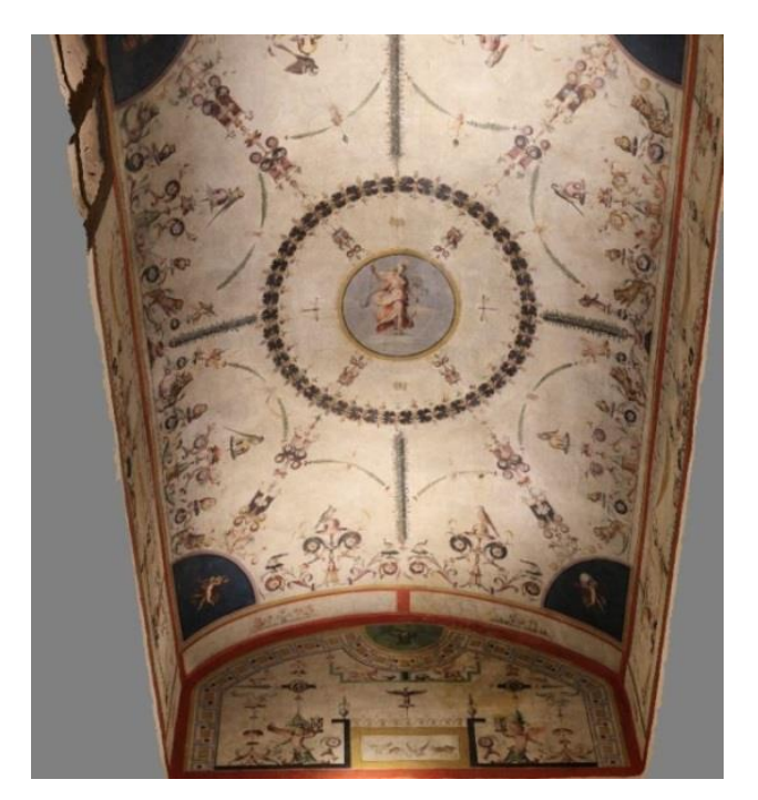
Figure 3. 3D photogrammetric reconstruction of the Stufetta tunnel vault.

The measurement time is affected by the value of this parameter, and it can change depending on the specific requirements.