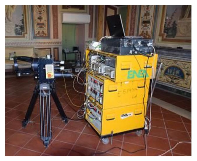
Figure 4. RGB-ITR laser scanner operating in the Landscape Room.

The RGB-ITR, shown in Figure 4, is a light detection and ranging (LIDAR) scanner based on the amplitude modulation of laser beams and the use of the lock-in technique for estimations of both colour and structure information [21]. Two pieces of software designed for the system, ScanSystem and itrAnalyzer, allow the user to set the scan parameters, calibrate data, perform post-processing analyses and generate 3D models [22]. This instrument can be used at any time without being influenced by external factors such as the variability of the ambient light. Differently from other laser scanners, the RGB-ITR system positions the beam on the surface using a TV-like raster, which ensures the same resolution on the lateral walls and the top. The entire digitalisation was performed by placing the scanner in the middle of the room and rotating the optical head until the entire field of view was covered by the laser beams. In this particular case, the laser scanner was placed approximately 5 m away from the target; in general, it can operate from a distance of up to 35 m. The resulting spot size of the 3 super-imposed laser beams was 0.3 mm, while the spatial resolution was set at 0.5 mm as a good compromise between the scanning time and the image