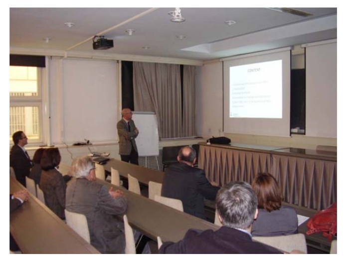
Figure 5. EU training of the SEE academic staff (professors) involved in the joint PhD study program in metrology.