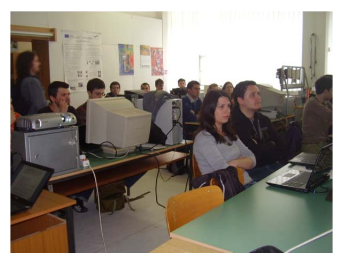
Figure 4. Joint lectures for PhD students in metrology.

Since the accreditation of the MSc study program in Metrology and Quality Management in 2008 at the Ss. Cyril and Methodius University in Skopje,33 students have enrolled this