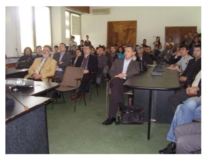
Figure 6. Joint lectures for PhD students in metrology open for the wider audience-with participation of metrologists from the industry and other metrology stake holders.