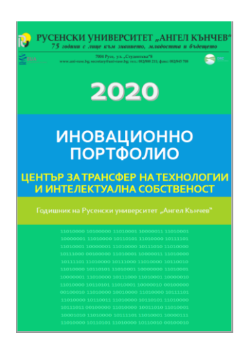
Figure 1. Innovation portfolio of the University of Ruse for the period 01 January 2020 – 31 December 2020 [In Bulgarian].

These assessments are done periodically depending on the level of reporting. The TTIPC presents quarterly reports to the Director and the Managing Council of the Research & Development Centre (R&DC) at the University of Ruse. In addition, the detailed annual report contains all the major