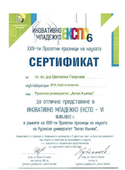
Figure 3. Innovative Youth Expo certificate.