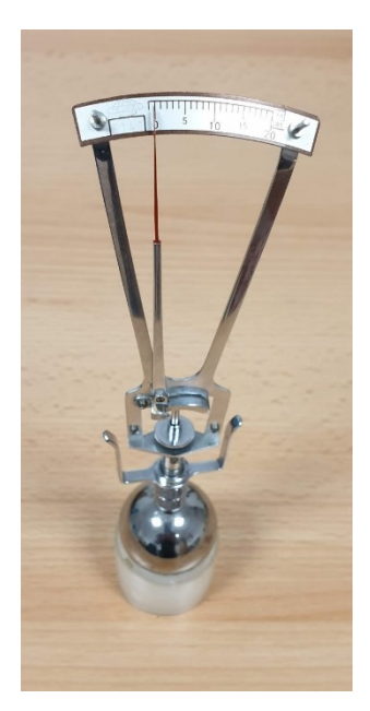
Figure 1. An impression tonometer placed on a precise calibration sphere.

Impression (or indentation or Schiøtz) tonometer is the oldest (more than 120 years) eye-tonometry principle still in practical utilisation, see Figure 1.