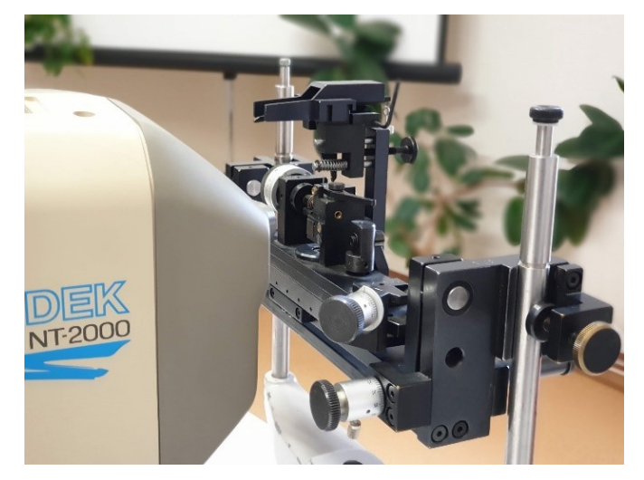
Figure 4. A detail of a non-contact tonometer with a flapper.

consisting of a silicone membrane surrogating a cornea with an inner pressure regulated by a water column which enables to compare the readings of a clinically tested device and a calibrated device, see Figure 7 and Figure 8.