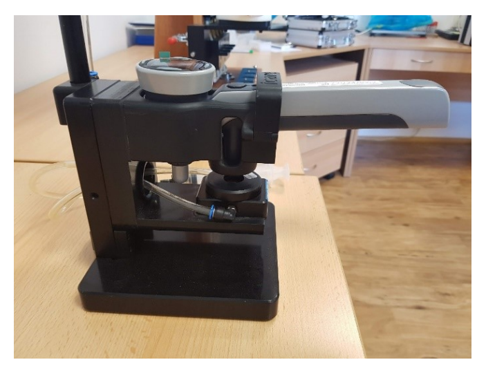
Figure 8. A rebound tonometer on its test bench (detail).