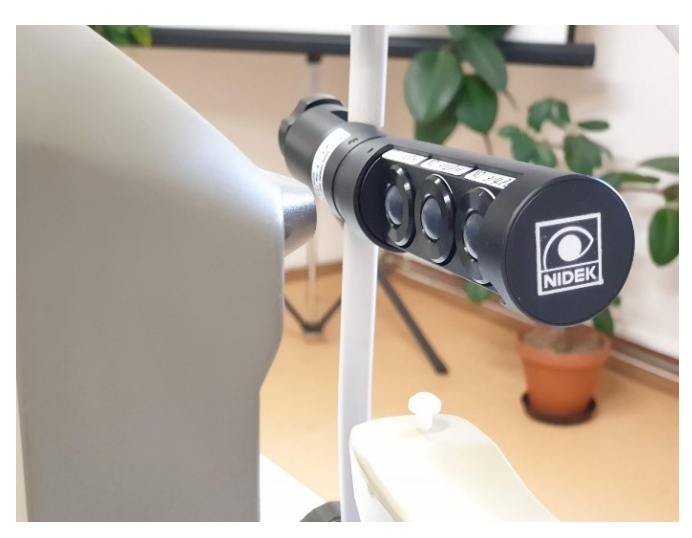
Figure 3. A detail of a non-contact tonometer with a set of the rubber eyes.

The traceability of these instruments must be again ensured to a clinically tested rebound tonometer via a testing bench