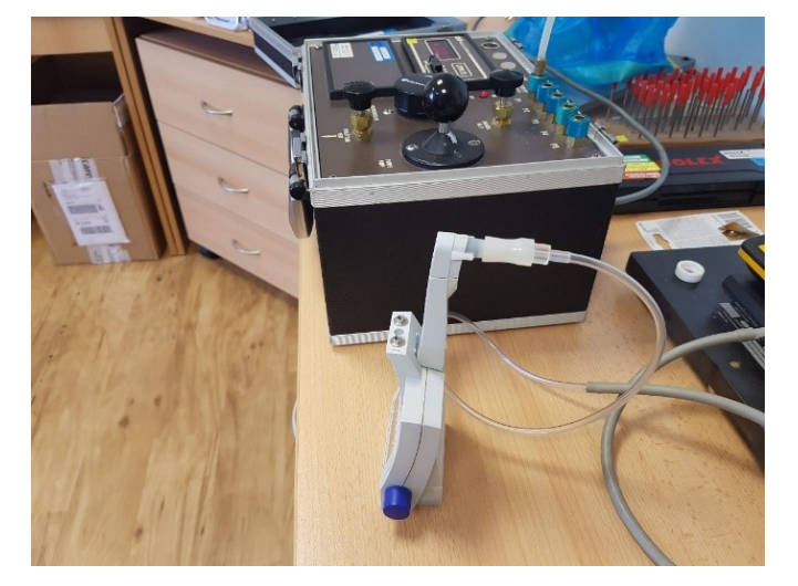
Figure 9. A contour tonometer connected to a pressure standard.

As a result of the fruitful cooperation of the European NMIs, the training centre for the IOP metrology at the CMI covers the most common eye tonometry principles, has the state-of-the-art equipment and remains in the intensive contacts with the NMI and academic partners to broaden its scope in the future.