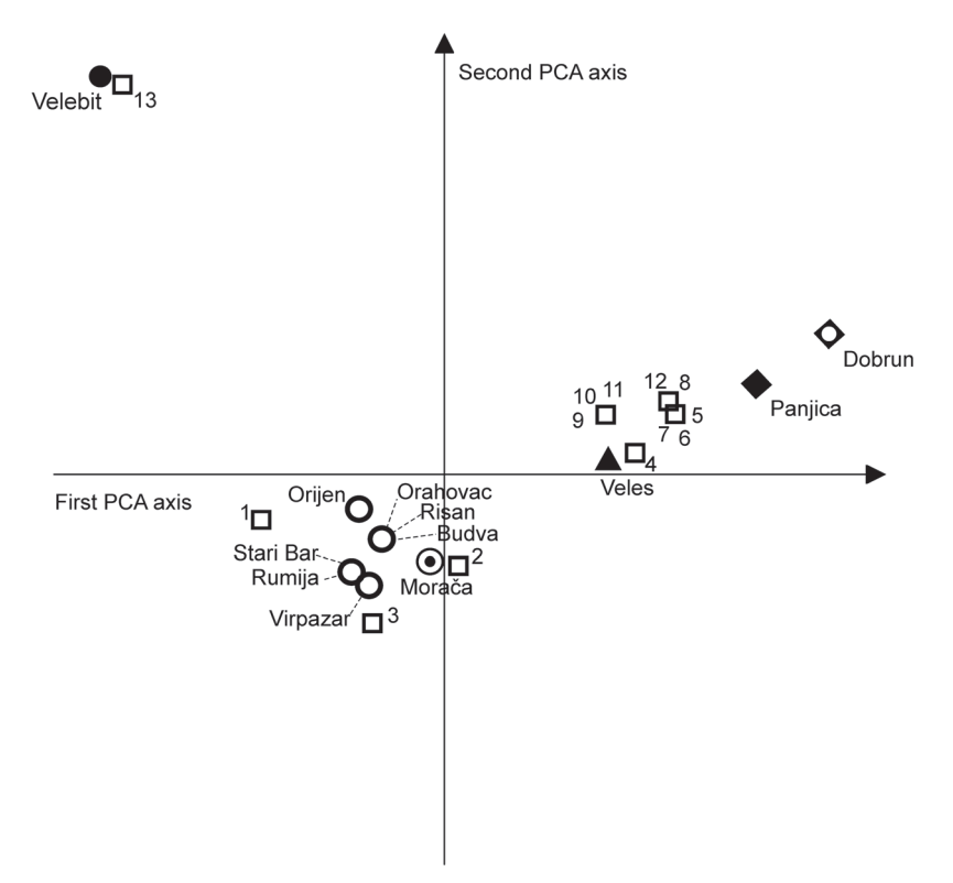
Fig. 3. Bi-plot principal component analysis (PCA) for populations and compounds detected in the methanolic leaf extract of the Campanula pyramidalis complex. Numbers from 1 to 13, next to the white rectangles, correspond to number of compounds from table 1. Other symbols correspond to clades as explained in figure 1.