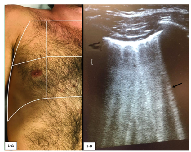
Figure 1: A: Lung zones in chest ultrasound (with permission from Credit A, Tozer J, Vitto M, Joyce M, Taylor L. Clinical ultrasound, A Pocket Manual. Springer, 2018). B: lung contusion with more than 6 B-lines (arrow).

Bedside lung ultrasound was performed during the initial assessment with simultaneous resuscitation after the arrival of the patient with blunt chest trauma to the ED and then all patients were sent for CXR and CT scan immediately. We used ultrasound scanner (SonoAce X8, Samsung Medison, Seoul, Korea) equipped with a 7.5 to 10 MHz convex transducer with 5-inch wide field. Ultrasound was performed by six emergency medicine residents who were familiar with ultrasound. First, a one-hour theoretical course was held