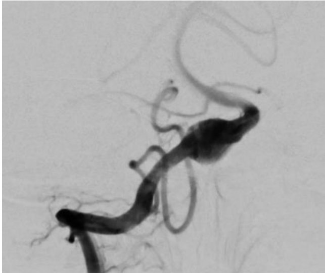
Figure 1: Conventional angiography confirmed the pseudoaneurysm of the right vertebral artery.