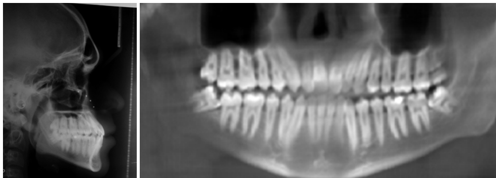
Figure 2: Pre-treatment Radiographs