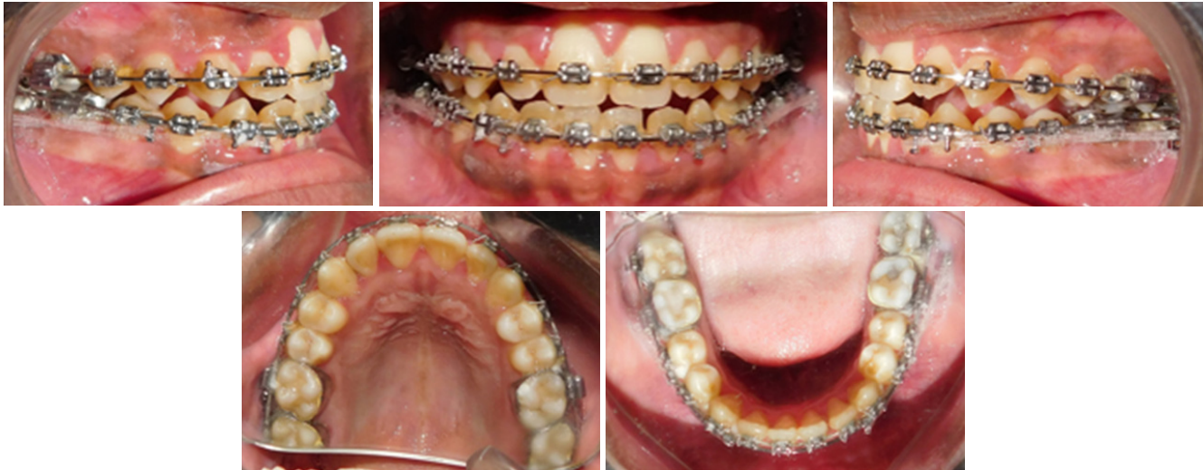
Figure 3: Buccal shelf screws for distalisation