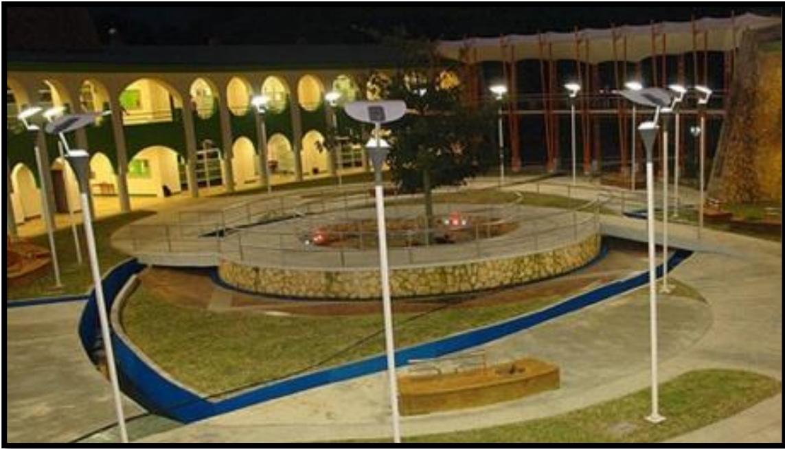
Figure 3, Intercultural University of the State of Tabasco (UIET)