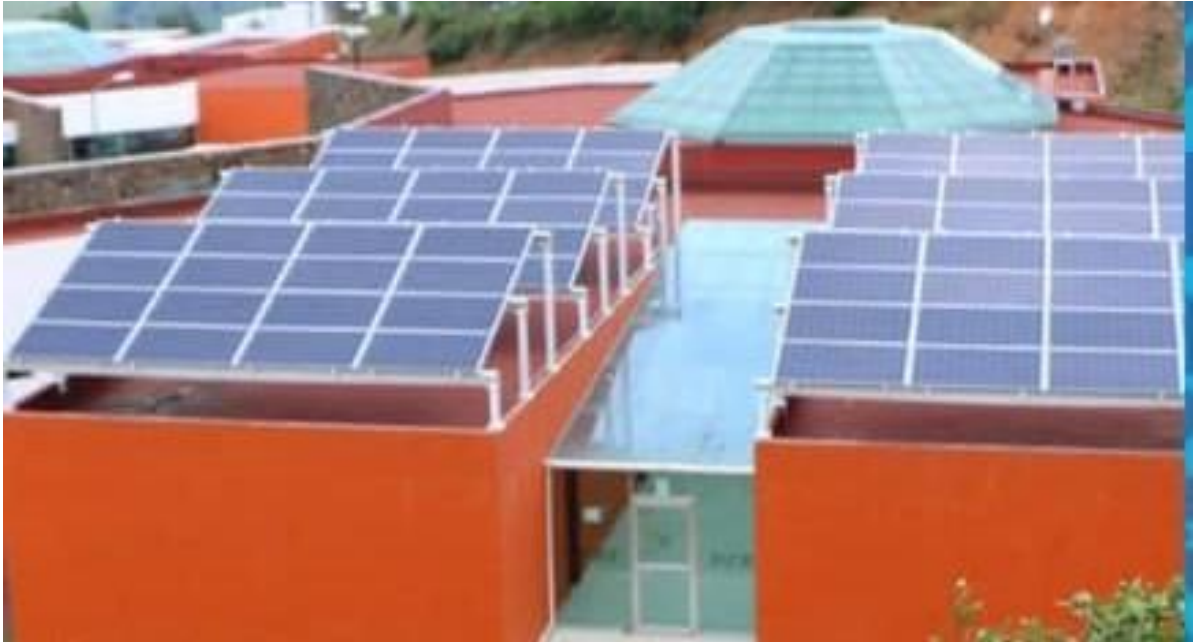
Figure 5, Solar panels in classrooms Source