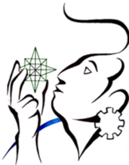
Figure 4, UIMQRO 12 logo.

This university has also recovered the symbolism of the region, from the logo that can be found on the university's website to the construction of its buildings.