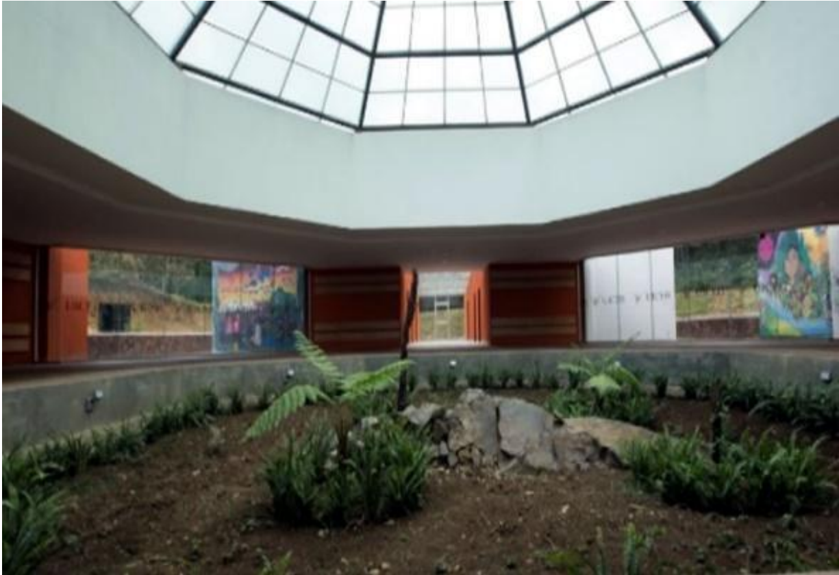
Figure 8, Student dome planter