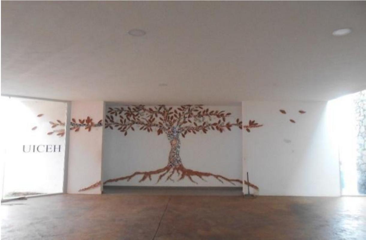
Figure 7, Women's and men's restrooms and a mosaic mural at the entrance