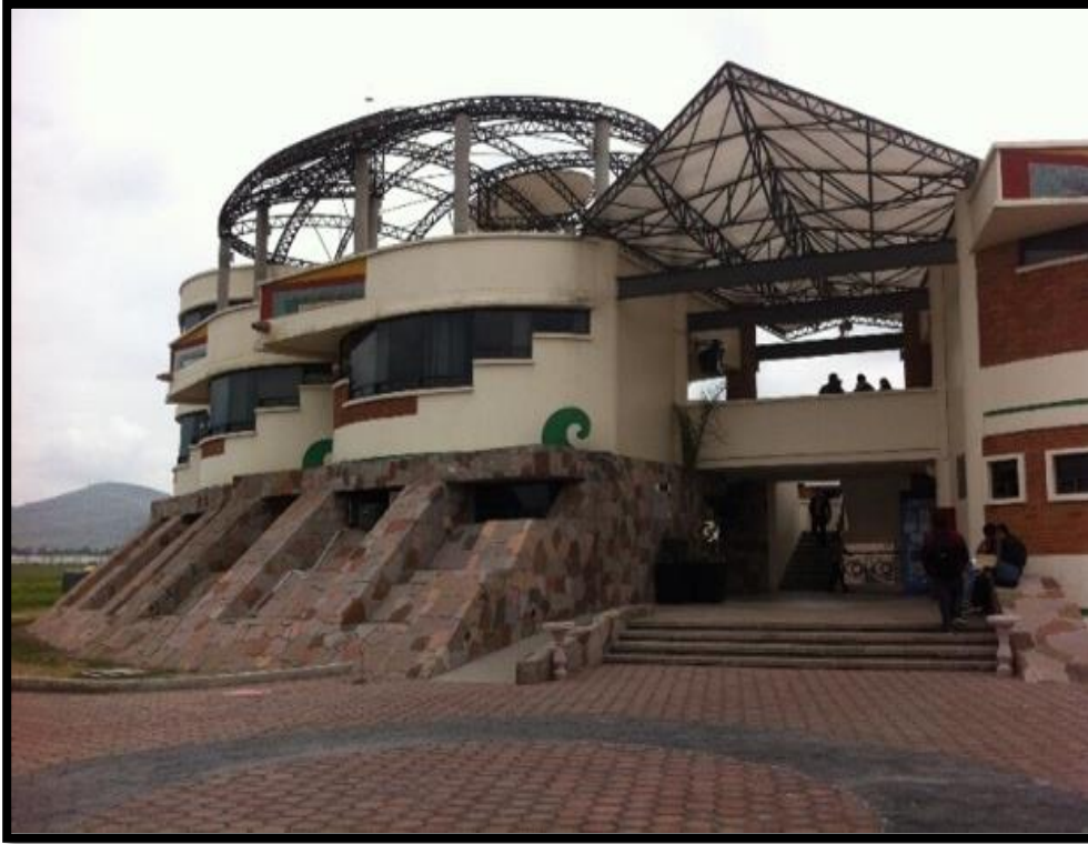
Figure 1, UIEM Main Building