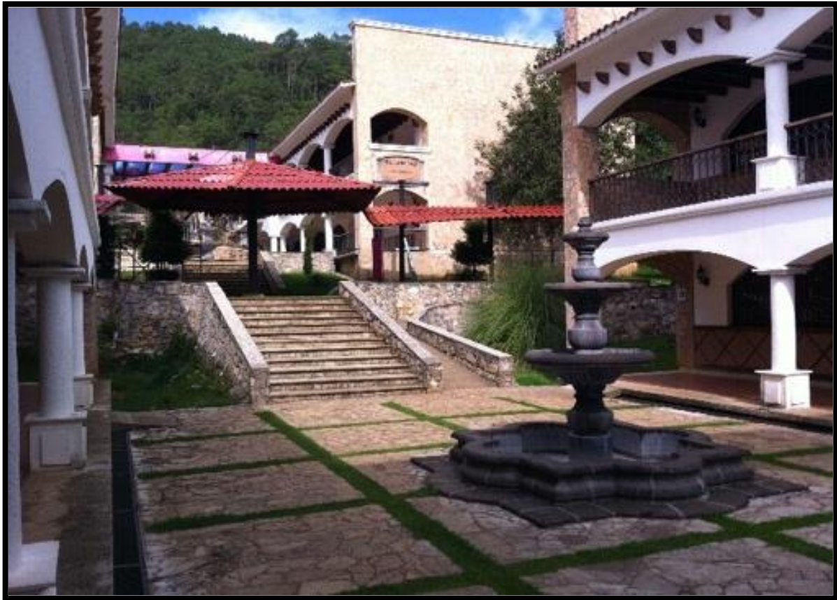
Figure 2, Architecture of the Intercultural University of Chiapas