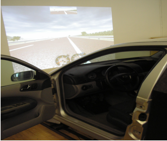
FIGURE 1. Car simulator.

The track is projected on the wall in front of the car simulator.