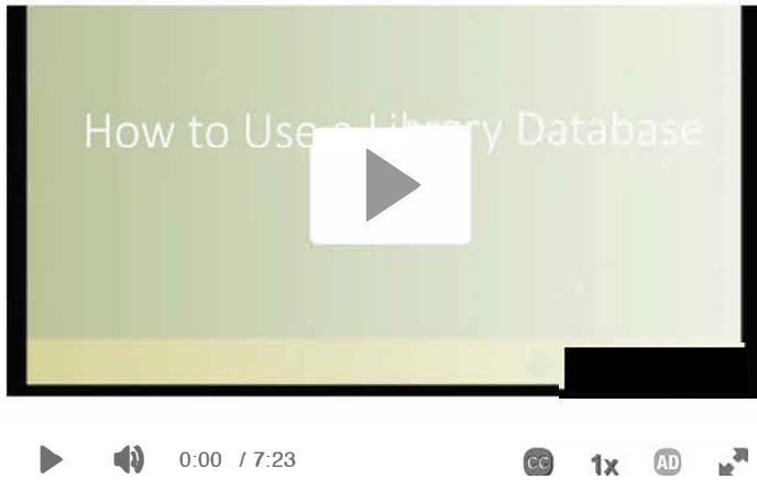
Using a Library Database to Find Articles

Go to the library website . Find an article for which the full text is available. Then fill out the information below.