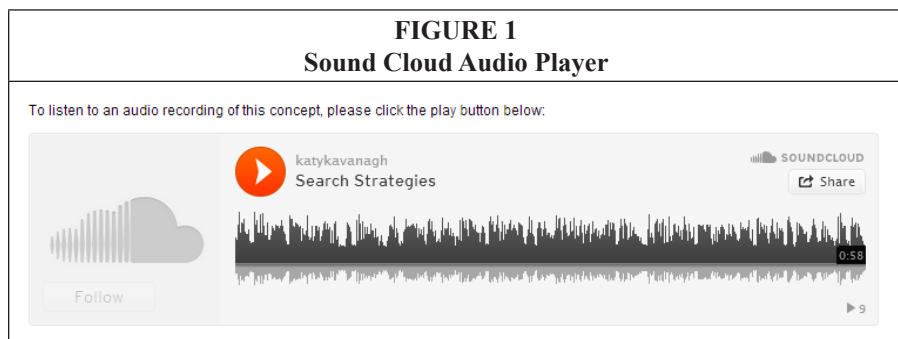
FIGURE 1 Sound Cloud Audio Player

Audio was used in the tutorial to reinforce important concepts that were also expressed as text in the tutorial, such as learning outcomes and keyword generation. The for-