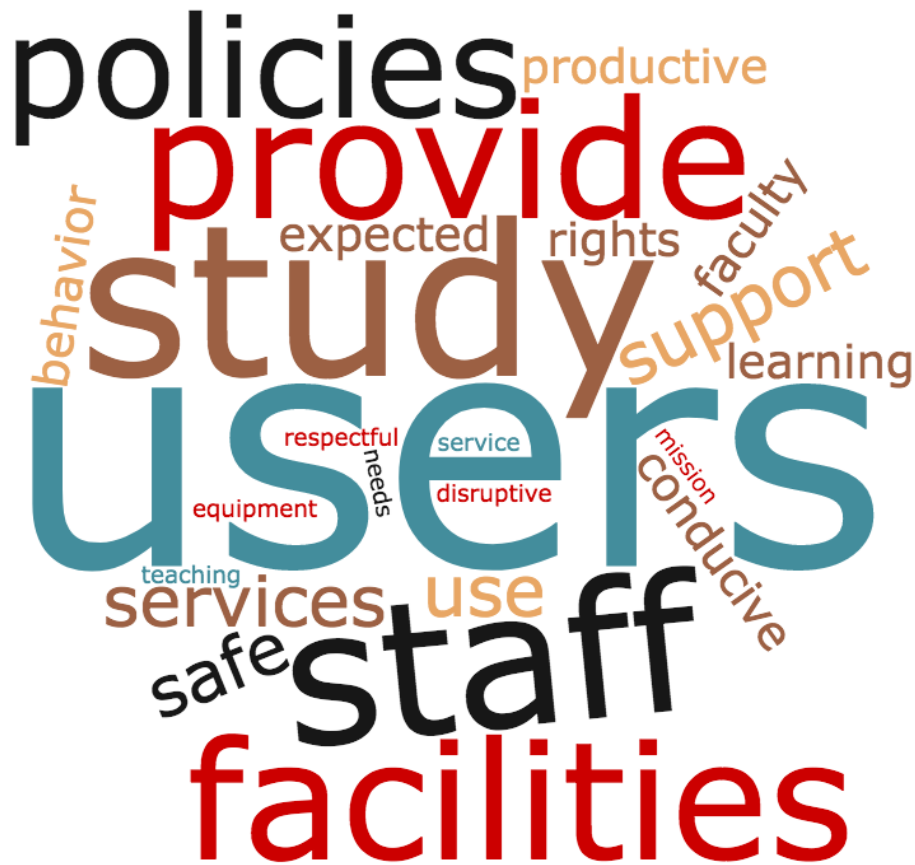
FIGURE 1 Common Preamble Words

Of the 31 codes of conduct reviewed, only four documents (13%) included explicit contact information and reporting instructions within the text. One document highlighted that the library provides accommodations for individuals with disabilities and provided contact information for requesting an accommodation. Another document invited people viewing the policy to submit feedback. Most did include information about what actions would be taken if a violation of the conduct code was reported (68%). Twelve documents (39%) stated the date the document was last reviewed and updated and often included the dates of previous revisions in the documentation. One code had not been updated for 17 years, and another had been updated just this year. On average, the date of “last update” was six years ago.