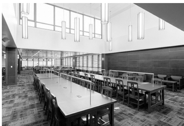
The UB Silverman Library Grand Reading Room.

The Open Library Foundation has been es-