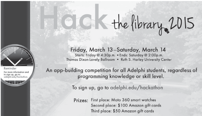
Hack the Library 2015 advertisement banner for digital and outdoor signage.

Volunteers and judges are crucial in events like these, and we established contact early with relevant departments, such as graphic design, computer science, and educational technology. This helped us sign on a lot of diverse volunteers and get word-of-mouth advertising to the students. As soon as we knew