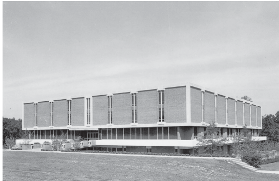
The Gregg Swem Library in 1966.