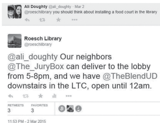
Example of @roeschlibrary interacting with one of its followers. View this article online for more detailed images.

APIs generally require some degree of programming skills, which may prove to be a barrier for librarians interested in learning from Twitter interactions. However, newer online services allow individuals to create