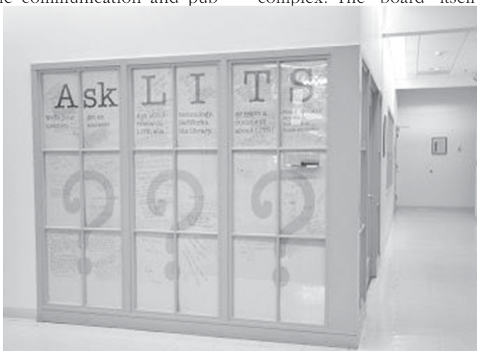
The Ask LITS board in full swing. View this article online for detailed images.

The Ask LITS board resides in a high-traffic hallway, between the Reading Room and the Information Commons in the library complex. The “board” itself is a multi-lit