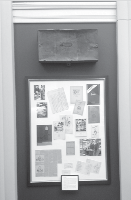
Time capsule and recreated contents on display at Shadek-Fackenthal Library, Franklin & Marshall College, Lancaster, Pennsylvania.