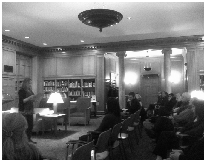
Student reading at the Medical Narratives reception.

showed a heightened sense of sensitivity and understanding for the human condition.