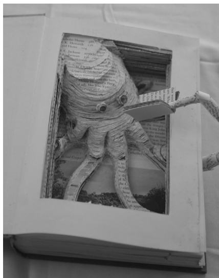
20,000 Pages Under the Sea by Dean Shin.

brarian standpoint: a Serials Librarian article entitled “Drowning our kittens: Deselection of periodicals in academic libraries” reflects the distaste-tinged gravity with which many of us approach weeding. 15