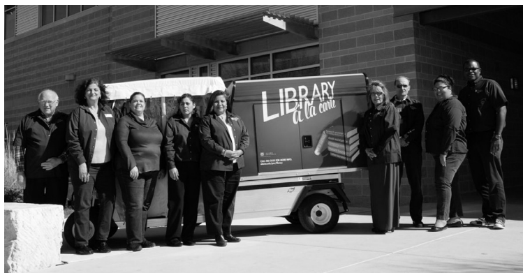
Library staff at Palo Alto College.

ians set up a library services “station” outside the student center. Reference librarians take turns on duty, instructing students on the