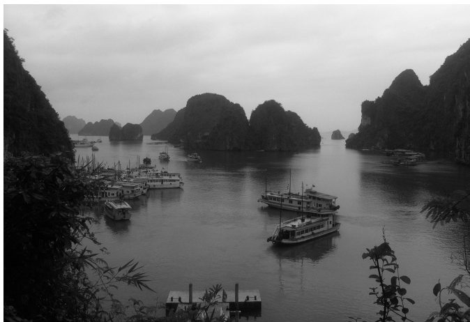
Ha Long Bay with boats, from above.