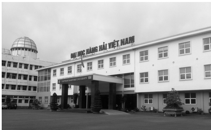
Front/entrance of VIMARU.