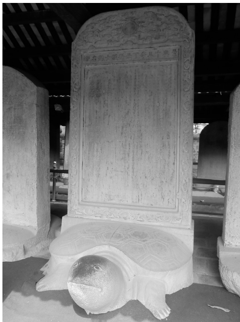
The stelae at the Temple of Literature.

class and frequency of meetings, I could not grade homework individually. But every student completed all the assignments posted on Moodle. I reviewed these in the afternoons, so I could give general feedback to the class the next day.