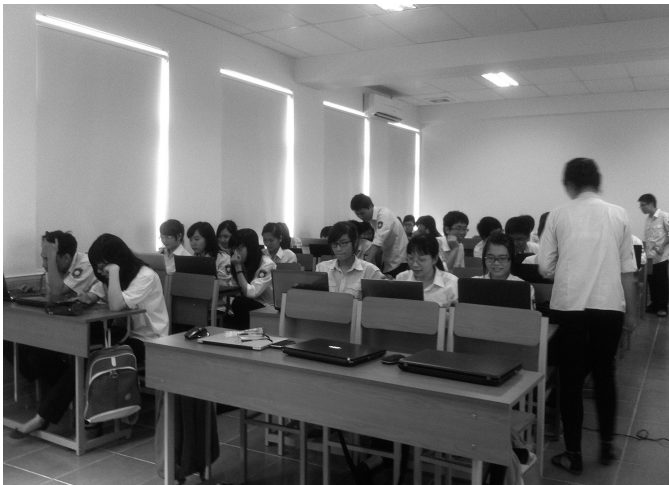
Students in uniforms, in class.

ency course, I was invited to Vietnam to teach the same course to students in the new program at VIMARU. The course would be taught over two weeks, every day, for three hours per day.