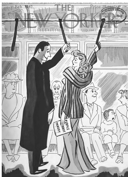
New Yorker parody cover of Purple Parrot , February 1942.

with high-resolution manually operated digital cameras. The stands are attached to a foot pedal, which allows the operator to easily adjust the distance between the camera and the item being scanned. Pages are hand-turned by the operator, who also does quality control checking of the scanned images once they're in the system. According to Elizabeth Clarage, CARLI direc-