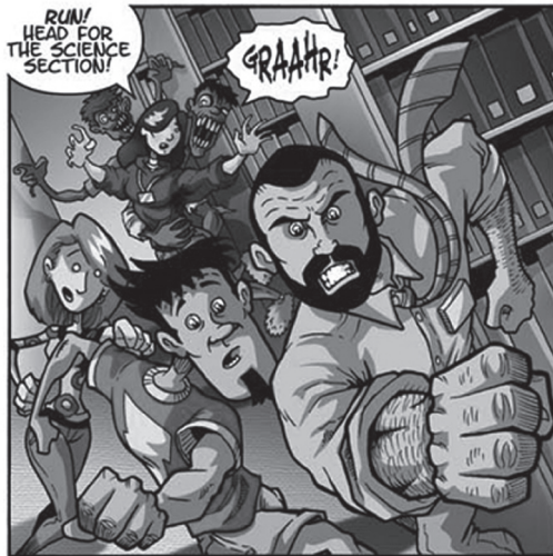
Panel from Library of the Living Dead .

raucous at times, and we ended up with a lot of spilled drinks and overflowing trash cans. But any frustration over the messiness and "misuse" of the library were assuaged by the