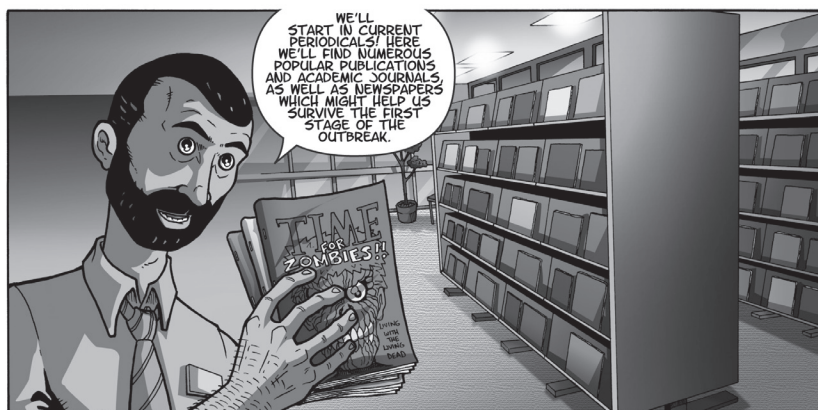
Panel from Library of the Living Dead.

I hope that our guide has inspired other librarians to move forward on their own creative ideas, no matter how ridiculous they may seem. Find those on your staff or in your community who could use their talents to fuel an innovative, fun , and probably inexpensive project. If you can locate and harness the enthusiasm of those around you, the task of creating a vibrant library becomes much easier. My student librarian loved to draw comics and was good at it. I gave him the opportunity to run with it. That's what worked for us. Find what can work with your library. Ask your peers and patrons what they