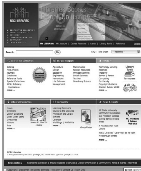
NCSU Libraries Web site before the redesign.

1. Make redesign an organization-wide priority. Rather than jumping right in to speculation about navigation or talk-