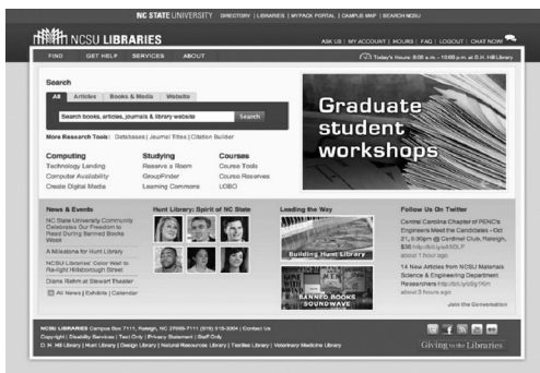
The redesigned site.

worth the time. A great deal of design and implementation time can be saved when everyone trusts that IA decisions are being made based on user data. That kind of trust is cultivated through conducting user research throughout the project and consistently