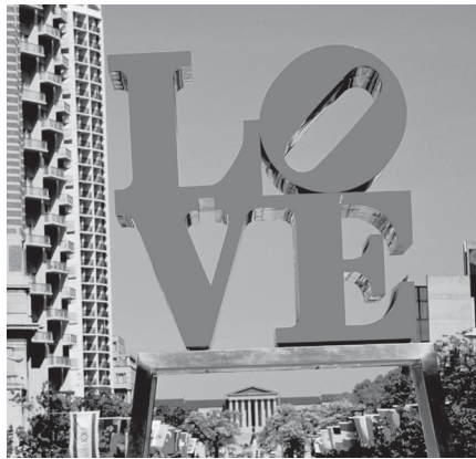
LOVE by Robert Indiana.

• Association of Fundraising Professionals (AFP) . With 30,000 members, AFP is a large organization that covers all aspects of the world of philanthropy. Free resources include blogs of interest to grant seekers and frequently published e-newsletters. Access: http://www.afpnet.org/ . ♪