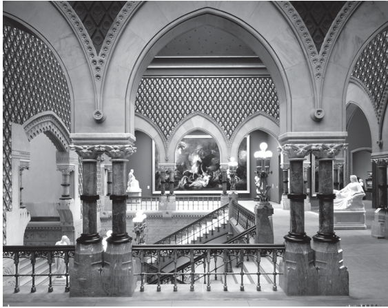
Pennsylvania Academy of the Fine Arts.

Wanamaker Organ at Macy’s (13th and Market Streets, www.wanamakerorgan.com/ ). The last place one may expect to find an organ