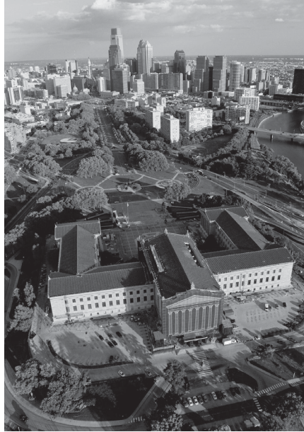
The Philadelphia Museum of Art and the city skyline.

seum of Art's permanent collection includes East Asian, European, American, and contemporary art. The museum is particularly strong in French Impressionist and Post-Impressionist painting as well as the paintings of Philadelphia Thomas Eakins. The Philadelphia Museum also sponsors "Arts After 5" ( www.philamuseum.org/artafter5/ ) on Friday evenings when the Great Stair Hall is transformed into a lively jazz-like club.