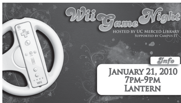
Digital sign from UC-Merced Library.

concise, and sensible digital signage policy will resolve most problems before they arise. In the case of student-generated content, UC-Merced Library chose to avoid evaluating the