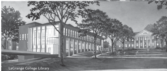
LaGrange College Library