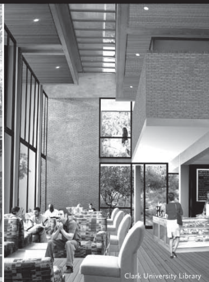
Clark University Library