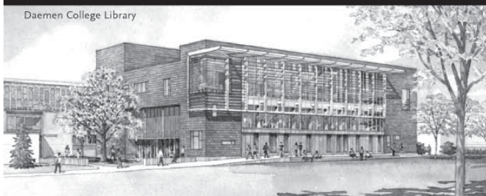
Daemen College Library