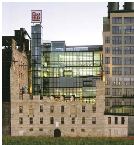
Mill City Museum was built within the ruins of the original Washburn A. Mill.

Across Washington Avenue from the Mill City Museum is the Minnesota Center for the Book Arts , which offers a multisensory environment with a gallery, printmaking and papermaking studios, deli, and gift shop. Great respect for the tradition of bookmaking is merged with the vitality of a cultural arts center. Exhibit information for spring is yet to be determined, but a visit regardless promises to satiate those who relish the tactile quality of books.