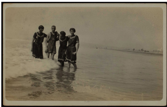
A day at the beach in San Diego, California, circa 1930, from the Turner Collection. Image courtesy of UC San Diego Library, Special Collections & Archives.

A new database established by a collaborative team, including the Penn State University Libraries, aims to provide centralized, consistent access to scholarly research metadata for Penn State faculty research, while eliminating much of the administrative work involved with research-activity reporting software used by higher education faculty.