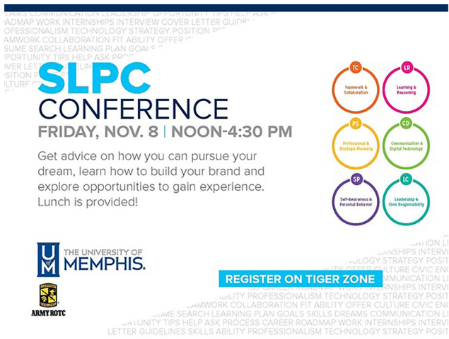
Promotional posting for the Student Leadership and Professional Competencies conference.

The nature of technical services work can limit our face-to-face interaction with the public—we spend less time in the classroom or staffing a public service desk. Despite our in-person interactions with students and faculty being less frequent than those of our public services counterparts, we make meaningful connections through curating resources and providing technical support. The instruction we provide in pursuit of resolving an e-resources access issue facilitates students' increased confidence in their research skills and a more highly developed understanding of library resources and systems.