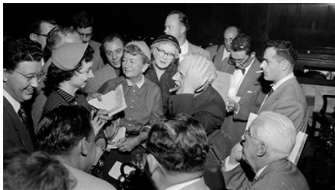
Dorothy Kilgallen surrounded by admiring fellow journalists at the Dr. Sam Sheppard trial.

and the Califa Group received grants to fund the expansion of digital and health-related programs in response to the pandemic. More information is available at www.imls.gov/news/imls-funds-five-pandemic-response-professional-development-digital-inclusion-library-projects .