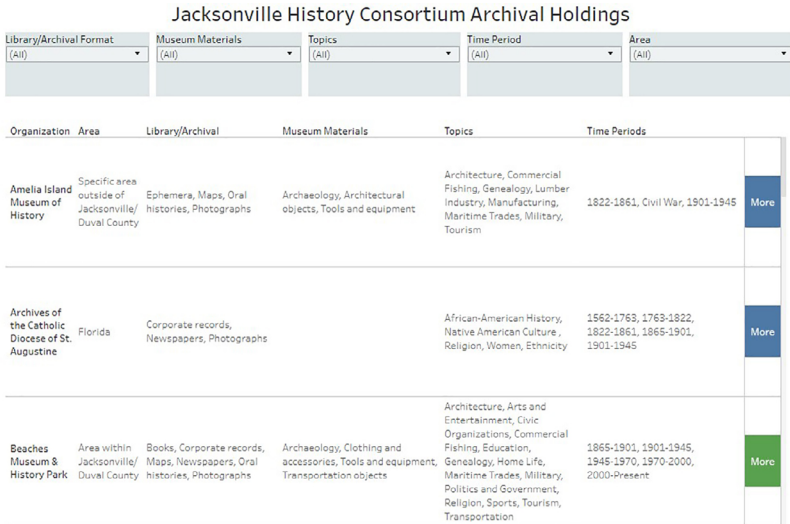
Figure 1: Sample of the Jacksonville History Consortium Archival Holdings Dashboard.

Once the LibWizard survey was in place, the director of technical services and library systems (TSS) looked to improve the way the data was accessed by users. The UNF Library decided to acquire Tableau, a data visualization tool that