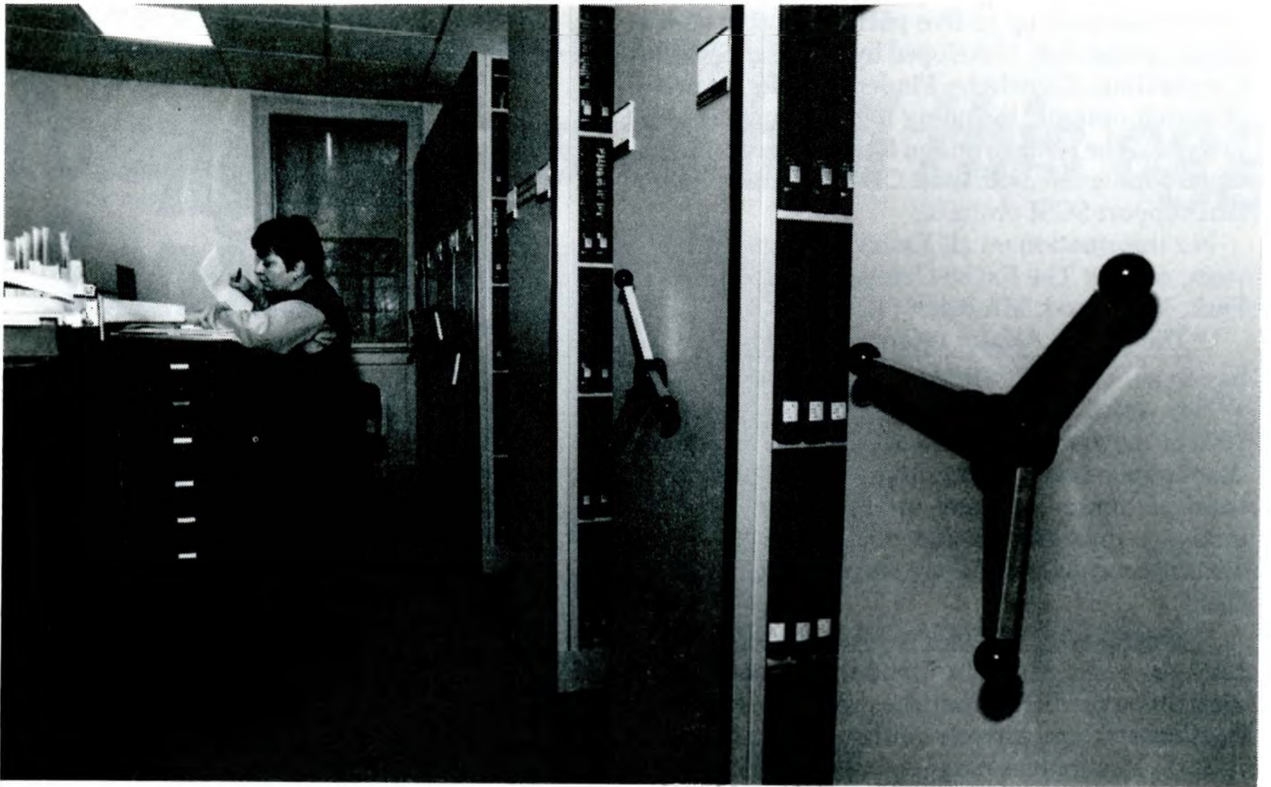
Yale Divinity School Library's technical services area, where a small mobile compact Spacesaver system was installed.