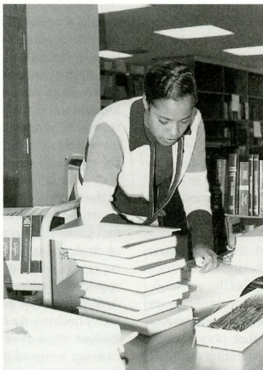
Student assistant prepares materials for addition to the collection.

financial aid officers will look unfavorably upon departments whose supervisors correct the mistakes of work-study employees is not a valid reason for exempting such students from adhering to normal rules of work conduct. 6 Librarians may wish to make financial aid officers aware of any disciplinary actions the library takes regarding its work-study students so that the officers understand the reasons for the actions. Supervisors cannot afford to overlook the mistakes of any student worker, which, if continued, will compromise library service. Because of its unpleasant ( Federal work-study . . . continued on p. 525 )