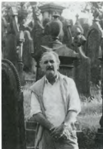
Carlos Fuentes in a cemetery in Haworth, England, in 1991.

statesman Carlos Fuentes have been acquired by Princeton University Libraries. The collection consists of more than 125 linear feet of materials dating from 1942 to the present. Fuentes is the author of numerous novels, plays, screenplays, short stories, essays, criticism, and works of journalism in a literary career spanning five decades. He was a leading figure in the literary "boom" of the 1960s when previously unknown Latin American writers began attracting international audiences. Fuentes's ca-