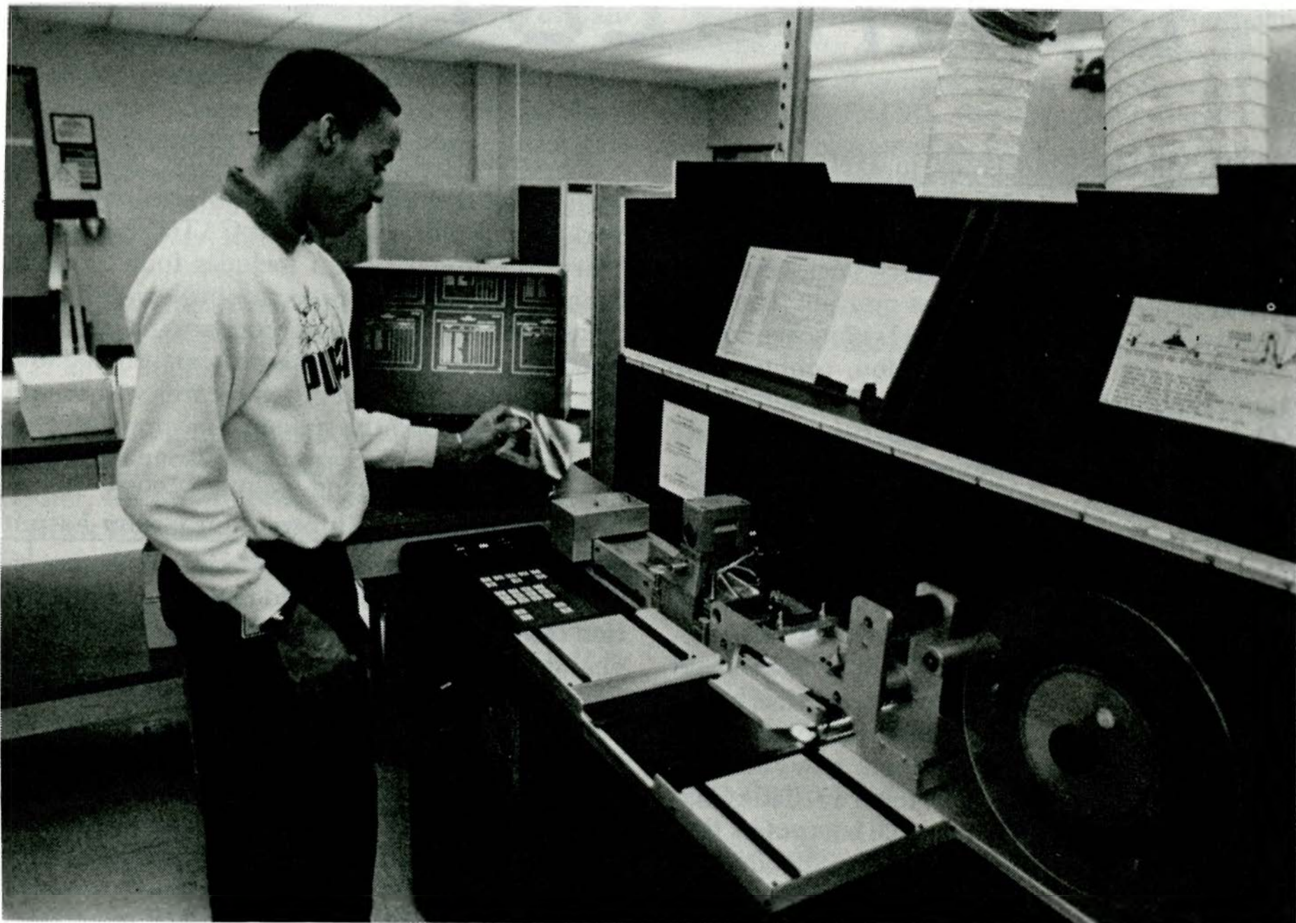
An operator checks quality control on InfoConversion's microfiche duplicator.

• Kodak has introduced a high-speed intelligent microfilmer, the Kodak Reliant intelligent microfilmer 2000. Of special interest in this new model is a "film write" capability that permits the system to write a clear, unique 11-digit code number alongside each document image on the microfilm, as well as on the document itself. This number serves as the individual image's address in a microform file, enabling an intelligent retrieval device to locate a given document from among millions. Another new coding capability gives users the ability to microfilm incoming documents in a random