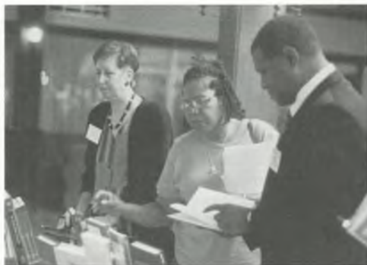
Attendees enjoy a book sale at the conference.

multicultural interaction session performed by Loaves and Fish Traveling Repertory Company engaged the audience in role-playing. The conference fostered networking among speakers and attendees with several opportunities for socializing including during a book sale and author signing after dinner.