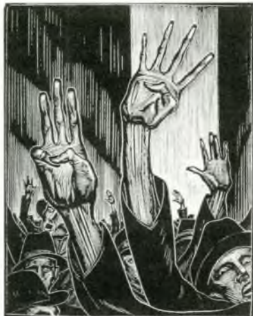
The Ardent Image: Book Illustration for Adults in America, 1920-1942, a 1997 Leab Award winner.